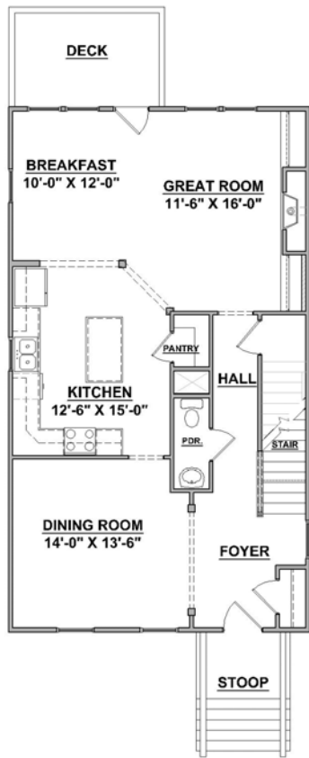
Main Level Floor Plan 1008 square feet