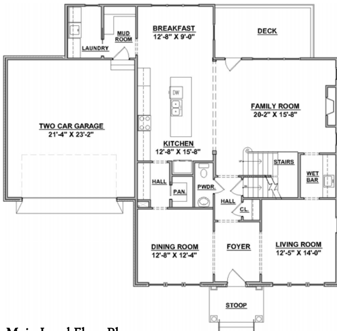
Main Level Floor Plan 1530 square feet